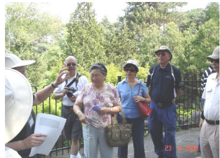
Refreshment at Burlington Lake Front