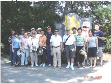
Lunch at Easterbrook